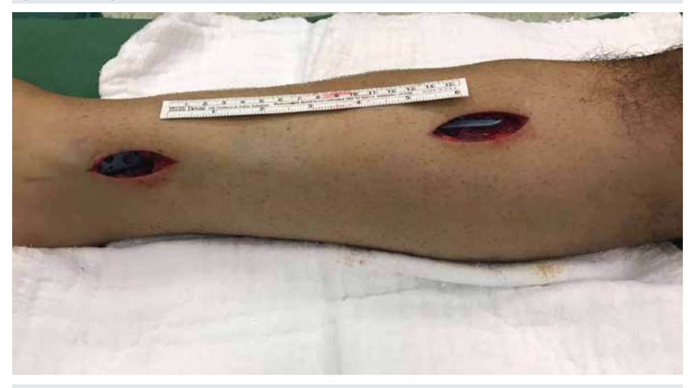
Figure 2. Intraoperative incisions after plate and screws were replaced